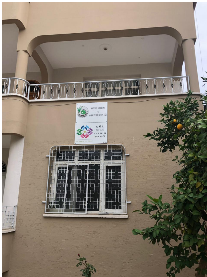
The main entrance of the new building of “Dar Zeytuna” Source: Photo by Hafsa Afailal - 27/11/2018

The actual “Dar Zeytuna” building is shared by both “Zeytin Yardım Ve Kalkınma Derneği” and “Gül insani Yardım Derneği” (Ward association in Turkish) as shown in the photo below.