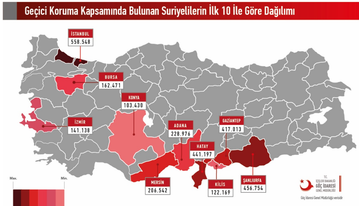
Distribution of Syrian refugees by region (top 10 regions)

Most of the Syrians live either in border towns, such as Gaziantep, Kilis, Şanlıurfa, Hatay and Mersin, or in metropolitan centres such as Istanbul, Bursa, Konya and Izmir, where job prospects are better (see map below). At the very beginning of the arrivals from Syria, the Turkish government settled the refugees in the camps built mostly in the border region. However, even in these early periods, the majority of the Syrians were living outside the camps, as urban refugees.