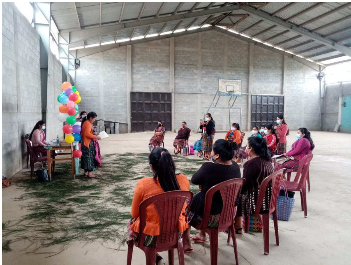
Culmination ceremony for the Women’s Rights Education Program

“We need psychological services for victims because they are traumatized, and they stay that way. We don’t offer recovery services for the victim; this is lacking in the service.” –DMM Director