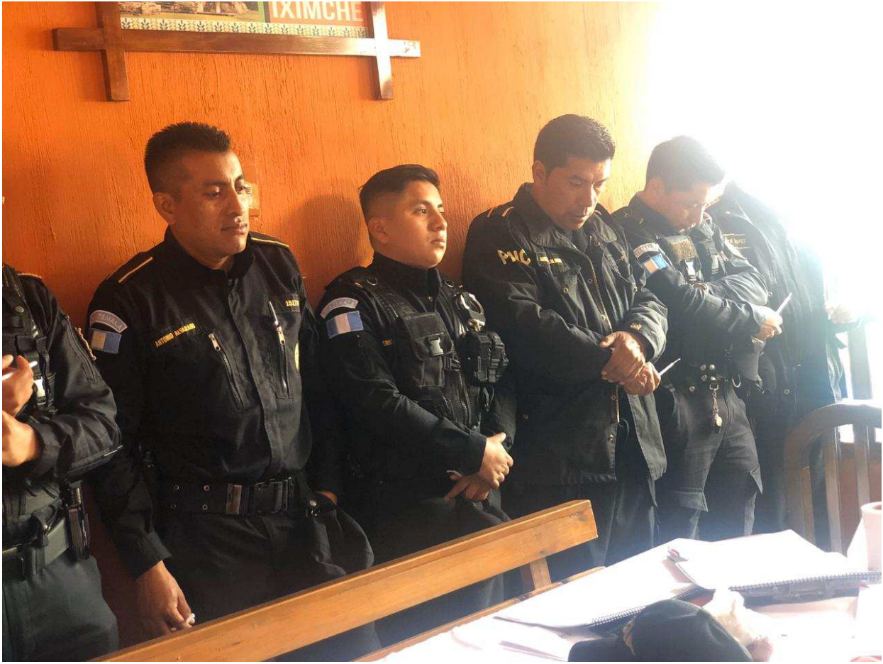
Training police officers

“I coordinate with [the project’s paralegal], I have a space for her in my office so that we can coordinate. They refer cases to me from Chimaltenango, from the Justice for cases of femicide to support victims... WJI helps me a lot because there are times when I say to her, ‘What do I do?’ What can I do and what can you do?’ and she says to me, ‘I will help the woman’ and she takes the case, which helps me a lot” –Director of the DMM