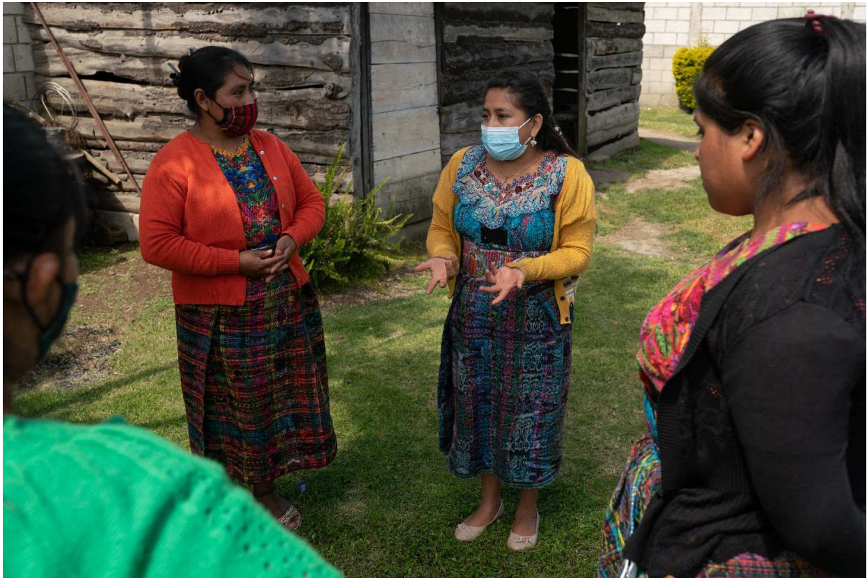
Community advocates sharing information with women in their communities

“Usually, you see a slow uptake in legal services over the period of the project... it takes a while for women to begin using our services. That was not the case in Tecpán, we saw referrals right away from service providers, we saw women further along with their cases and needing more comprehensive legal support” –WJI Executive Director