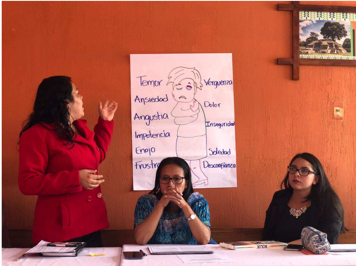
Training of service providers

“We find that women don’t seek legal services just because they exist... there’s not an understanding of what protections exist and what their rights are and nor is there a recognition of individual women as valued members of a community who have rights... the legal literacy component and empowerment piece of it around self-esteem and communication is really critical to ensure women... not only know their rights but begin to use and shape the law too. –WJI Executive Director