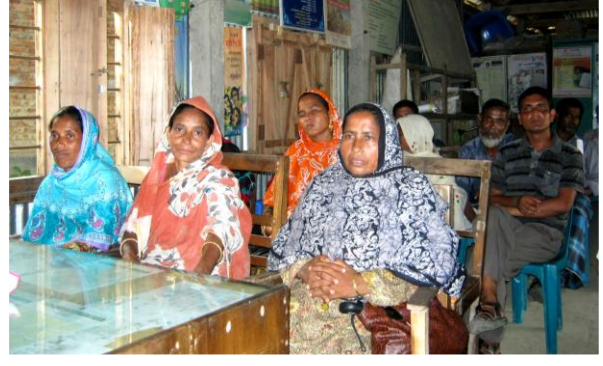
Discussion among Union Parishad members

independent Research and Evaluation Division (RED) would carry out the post-project evaluation, using the M&E budget reserved for use by UNDEF. BRAC claims it did not undertake a second survey to determine the project's impact, as it had planned for RED to conduct an impact assessment of the ACALG project in the context of the post-project evaluation. According to the grantee, no clarification was provided that BRAC's proposal to engage RED for the post-project evaluation. Would not be given further consideration.