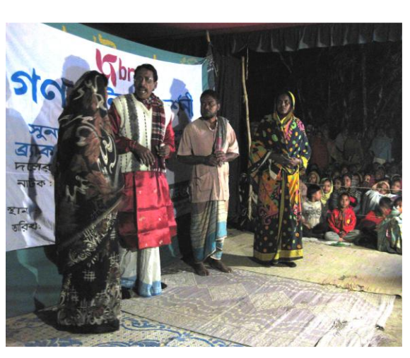
Popular theatre performance

Three-day training programs for UP members and chairmen reached out to 103 (planned: 100) Unions and were implemented by trained trainers, with an outcome of 1,196 trained beneficiaries (slightly lower than the planned number of 1,300). According to the project grantee, the lower trainee mobilisation was due to the delay of the UP elections, which caused uncertainty and lack of interest among UP members. The grantee therefore dropped the planned one-day refresher training for 300 female UP members and provided, following the delayed elections, a three-day training to 161 first-time female UP members instead, thus improving the resulting number of trained beneficiaries to 1,357. Training and exposure