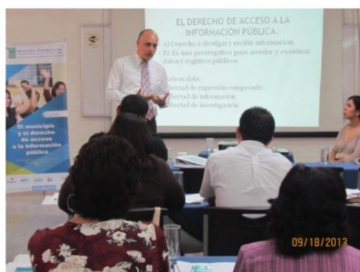
Course I: The municipality and the right to access public information, aimed at

The intervention was geared towards promoting changes requiring long-term processes and for