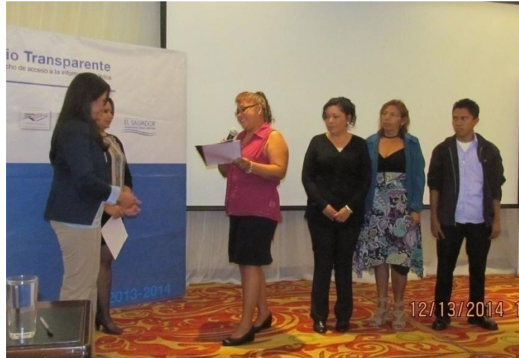
Submission of the report on oversight in Ciudad Delgado to the Director for Transparency of the Secretariat for Citizen Participation, Transparency and Anti-Corruption.

In order to do this, the Convention set up with FUNDAUNGO should continue to be implemented so that it favors the coherence and continuation of future programs/initiatives on capacity-building. In addition, the IAPI could ask FUNDAUNGO to provide permanent assistance through an agreement on technical cooperation, in order to increase the coverage of municipalities in an efficient and effective manner, through adequate planning and coordinating efforts of other public and non-governmental actors. The MINED should make use of the energy and creativity that the project generated among directors and teachers to reproduce the RAPI knowledge for teachers and students by using language, materials and methodologies that are adapted to specific ages, thereby complying with article 46 of the LAPI which states that study plans and programs in formal education should include at all levels of education (except higher education) content that displays the importance of transparency, the RAPI and citizen participation in public administration (see conclusions iii and vi).