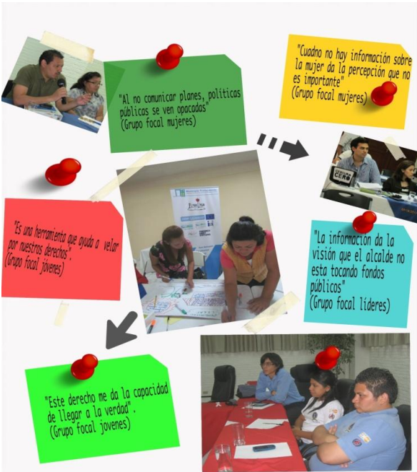
Course I: Municipalities and the Right to Access public information, Participatory exercise.

The municipalities were selected on the basis of a call for expressions of interest, while care was taken to ensure that there was a diverse political representation as well as diversity in size and taking into account the municipalities' interest and commitment to participating in the project. The UNDEF project was carried out in more urban municipalities close to San Salvador, since this is the sphere of FUNDAUNGO's influence. The EU project moved out of San Salvador, since it was also associated with FUNDAMUNI, which has a greater geographical presence.