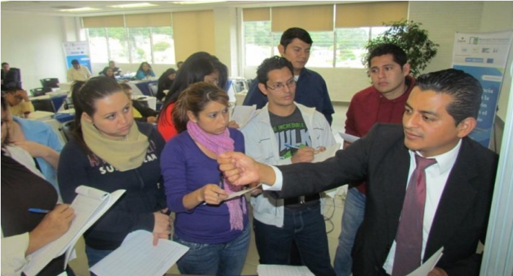
Lectures and exercises during the in-person session, Diploma course, Antigua Cuscatlán.

One of the major impacts was raising the issue of access to public information up to the next level in the municipalities and them becoming aware of the challenges they face and the risks involved in not meeting the legal requirements. Through the capacity-building and awareness-raising activities the project had a strong impact on the process that the municipalities have to carry out in order to implement the enforcement of the LAPI. The interviews and focus groups made it possible to appreciate the highly positive rating of the project's contribution, particularly at the local level. The information officers and archive-managers of the municipalities explained how little they knew about the legal text and the requirement to enforce the LAPI and how their participation in the Diploma course had allowed them to gain a completely different view on their role within the municipality.