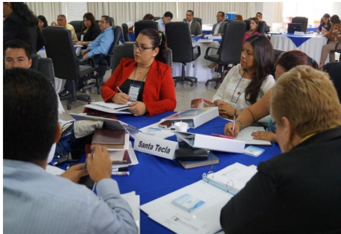
Participantes del Seminario: Desafíos para la aplicación de la LAIP en el municipio, provenientes de departamentos de San Salvador y La Libertad.

For the follow-up and the execution of the budget, the NGO has specific procedures for managing their accounting and account management system. The accounting system is organized by funds and each project has a completely separate bookkeeping. This system works with chapters which are defined in the approved budget according to the Convention established with each project. Furthermore, the accounting system is registered in accordance with the legal standards established by the Ministry of Governance. In accordance with these requirements, two audits were carried out which reviewed the entire bookkeeping and operation of the NGO. The audit is carried out by an external auditor and is linked to fiscal management. In addition, a project-specific audit was carried out.