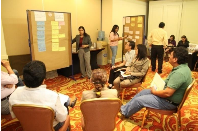
Consultation on training City needs and the barriers to enforcing the LAPI with officers from Halls from la Libertad and San Salvador, April 2013.

The project was relevant since it intervened at a very timely moment, shortly after the recent adoption of the Law on Access to Public Information (LAPI) in 2010 and its entry into force in 2011, which establishes obligations on the issue, both at central level and at municipal level. The creation of the governing body, the Institute for Access to Public Information (IAPI) at national level was carried out without ensuring that sufficient capacities were in place to promote and support the enforcement of the LAPI and to respond to the needs of the municipalities.