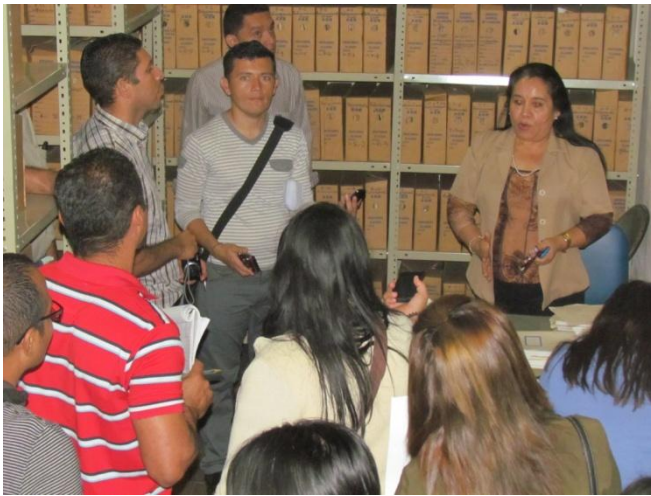
Visit to the General Archive of the Nation and the Ministry of the Economy.

that they would however require technical assistance and a small amount of resources to support this initiative.