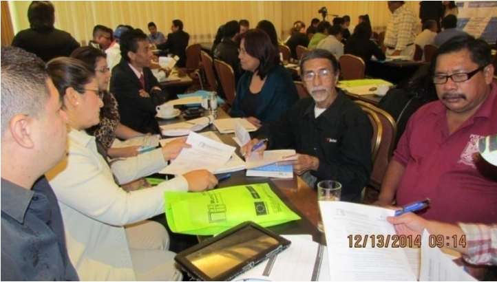
Oversight groups during the training session, seminar: Citizen oversight of the application of the LAPI.

The project was positively rated by local leaders and social promoters who participated in the seminars and coaching sessions to establish practices of oversight and who said that they would not forget how to conduct oversight and how to reach the municipality to request information. In Santa Tecla for instance, it was said that in the beginning not many people requested information but that the figures showed a positive trend in the new paradigm that was being applied both by the municipal staff and by the citizens.