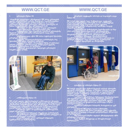
Flyer used by beneficiaries to lobby for and inform about their rights

When a Georgian NGO applied to the country's constitutional court concerning the legal capacity of persons with disabilities and the topic became a matter of public discussion, the grantee saw an opportunity to draw more of the public's attention to the still pending UNCRPD ratification. Gathering journalists and representatives from both the government and NGO sector, QCT spontaneously organized a promotional event to present the findings and disseminated numerous copies of the project's situational analysis and best practice reports. As planned, a final conference was held at the time of the project's completion, attended by the club's beneficiaries and their families. They expressed their appreciation for the opportunity to acquire new professional skills, while socialising among and making friends with other persons facing issues similar to theirs.