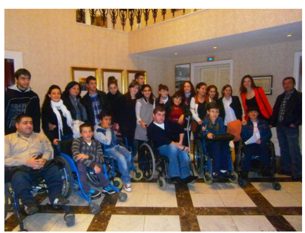
Evaluators' meeting with former QCT club graduates, their families, and the project's former administrative and professional staff

Taking into account that more intervention will be needed to promote and achieve the protection of the right to work and employment of persons with disabilities (c.f. impact), and given the fact that the project's initiative has created an expectation among the project's target group that the grantee will play a lasting key role in providing access to vocational education, it is of utmost importance that QCT reviews its approach strategic towards the donor community. It is regrettable that QCT failed to recognize the importance of a more advanced monitoring of the project's progress (c.f. impact section, on indicators). Monitoring results could have been presented to potential donors as evidence of QCT's ability to facilitate access to society and labour market for its beneficiaries. It also appears that the grantee did not perform a targeted donor pre-screening. As a result, QCT reportedly lost time with writing proposals, which donors rejected as not being covered by their funding objectives.