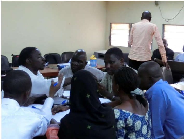
A working group CSO-magistrates

all the grants reached some 200 direct and 1,500 indirect beneficiaries. ii) The process for the selection of the grants was public and transparent, based on pre-defined criteria for selection and the results were distributed to all applicants. iii) Before the beginning of their operations all grantees were given a 5-day training on monitoring and evaluation of their grants, so that M&E became an integral part of the micro-projects. iv) Shortly after the end of the grants (carried out between August 2012 and January 2013) a 2-day seminar was