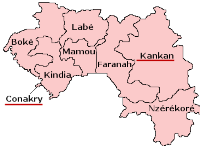
Figure 1 – The Tribunals of first and second instance

• Relevance of the methodology of intervention: the approach of the project is definitely sound: by tackling the absence of mutual knowledge of the civil society and the judiciary and triggering dialogue between these two societal components it aimed at contributing to the process of reform of the judiciary through joint advocacy. A key point of strength of the methodology was the key concept that –in order to dialogue and cooperate- the beneficiaries of the project had first to be trained. This key concept informed the overall structure of the project so that participants to the two Outcomes of the project were largely the same.