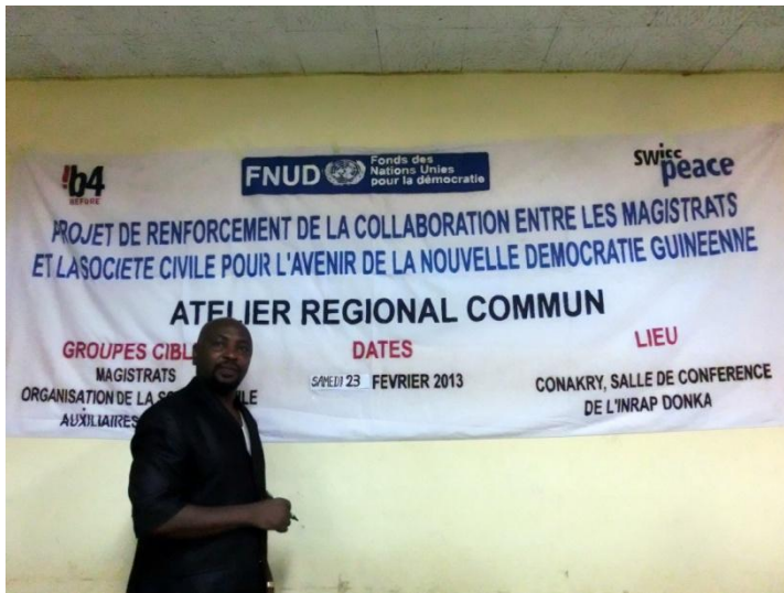
A common regional workshop in Conakry

Outcome 1 / Activity 2 (development of the training outline and materials) – The activity (broken down in 3 sub-tasks) was fully developed and the outputs delivered on time. In the performing of this activity the project management demonstrated a good deal of adaptability,