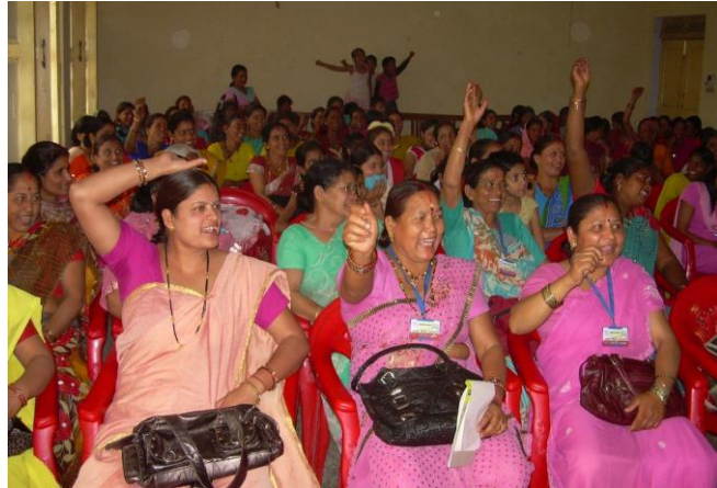
Recent federation meeting, Nainital district

Accordingly, HPPI has realised that the gains made by the project require further consolidation through continued work with federation members. As efforts to obtain new donor funding for an initiative specifically targeting the federations did not succeed to date, the grantee's local staff in Rewari district facilitates continued knowledge sharing for, and the provision of assistance to, federation members alongside the implementation of community development projects supported by other funds. Such type of support is, however, missed among federation members in Nainital district, where HPPI seems to have phased out its engagement in community development activity without a clear exit strategy.