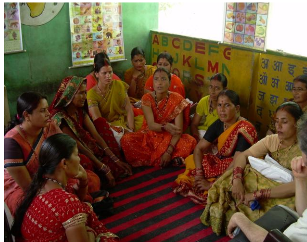
SHG Groups, the rural communities' social conscience

The project's workshops on women's rights have targeted both elected PRI members and SHG members. While elected PRI members have the constitutionally assigned role to influence decisions of relevance to the development of the local community, SHGs mobilise engaged citizens in articulating social and developmental issues. Integrating both stakeholders, the workshops established convergence of views on social issues, such as gender discrimination, domestic violence, the problems arising from the dowry system and education for girls. SHGs are likely to progressively gain strength, as there are currently considerations at national and state levels to provide financial allocations to them. They are hence expected to become even more important partners of PRI members for future budgetary considerations in community development processes.