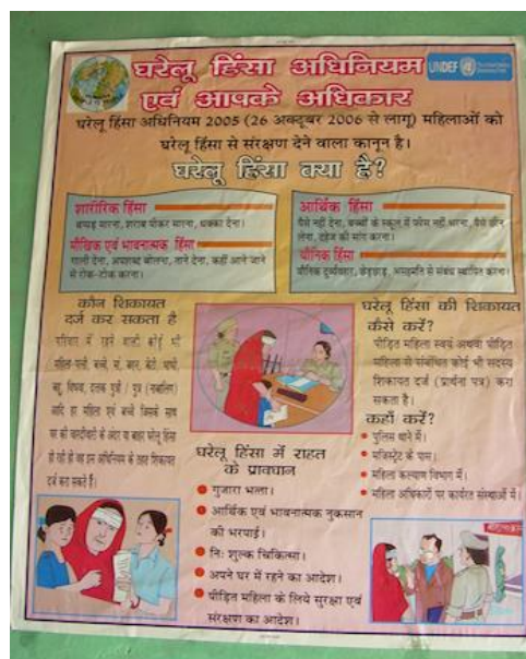
IEC material illustrations ensure illiterate recipients' access to key messages

The grantee also expanded the project's target group by offering training to local SHG members in its 31 workshops on women's rights. Given their involvement in local community development, the project document envisaged linking SHG and PRI members, though without specifying the approach that was going to be taken for this purpose. The inclusion of SHGs in these workshops is considered advantageous by evaluators, as joint training contributed to increased awareness of social and development issues among elected PRI members, thus enhancing the project's effectiveness.