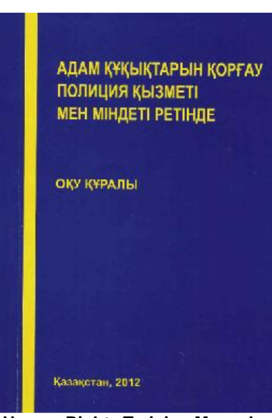
Human Rights Training Manual (Student Edition)

Accordingly, the consultations between BHR, MIA and Human Rights Commission arrived at a choice of training manual topics and associated co-authors ensuring a combination of academic expertise and practical field experience. In other words, the objective was to develop training material which clarified that human rights values are constitutionally guaranteed, that the police is at the service of its citizens and that therefore police officers are committed to certain rules of professional conduct when it comes to the execution of typical functions (e.g. investigation, detention, the use of physical force or arms), the interaction with people (i.e. indiscriminate, regardless of social background or ethnicity) and the handling of emergency situations. Coauthorship by experts from the Human Rights Commission, the MIA's Education Division, the MIA's B. Baysenov Academy and the Bolashak University's faculty of law; as well as translation of all outputs from Russian into Kazakh language aimed at acceptance and widespread use of the training manuals.