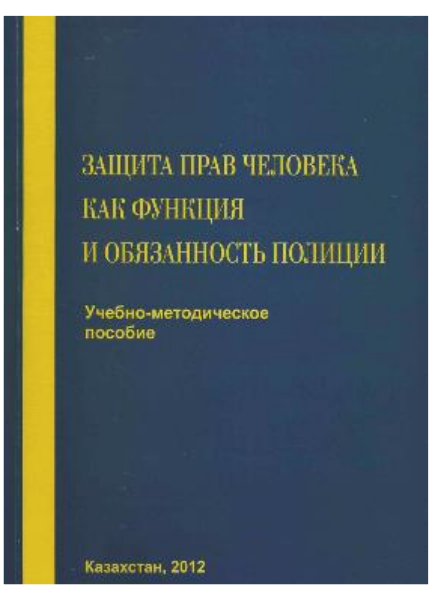
Human Rights Training Manual (Tutor's Methodology Edition)

However, the MIA's input to the training manuals took more time than anticipated. As there was a serious risk that the workshops (planned to train future trainers on the content and use of the manuals) could not be held, BHR took initiative and organized an additional "round table" to clarify the purpose of the workshops and to once more commit the partnership to timely delivery of their contributions.