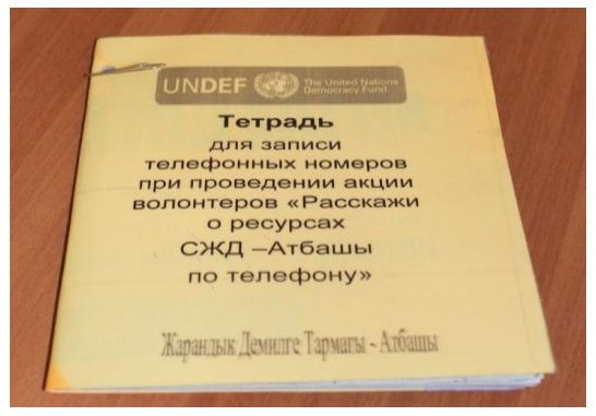
Enquiries made by citizens about JDN's, information resources: Atbashi office log book

Project staff also maintained a log book of persons visiting the office to make use of its information services. In the summary of all regional offices below<sup>22</sup> most user groups display a fairly balanced representation. The disproportionate share of the 'specialists and office workers' category was explained to be due to the interest in accessing the legal database TOKTOM.