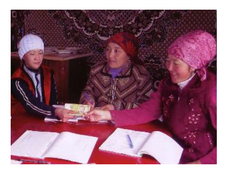
Left: previous waste management issues in Koksai. Right: first revenue-based salaries paid out thanks to a successful local economic initiative of local farmers in Akmus.