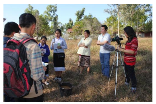
A frequently expressed concern: the unavailability of technical equipment, e.g. for future youth film productions

Secondary school teachers were also highlighting the fact that youth group members conduct their activity voluntarily after school hours, which is why they usually involve the provision of snacks for the kids and the payment of an allowance, plus a modest project budget (for field expenses, e.g. phone calls and fuel for transportation), for the teachers. Some reported to have continued without funding, improvising by borrowing or using (out-dated) equipment, which at some point though became unavailable or broke, all of which led to frustration among youth leaders and their group members. In another case a youth group deferred its activity to weekends, organising itself