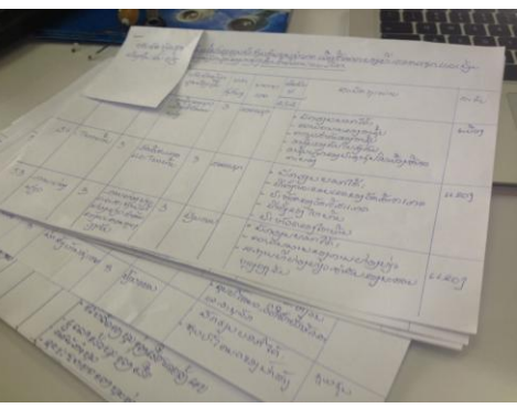
Finalised primary school curricula

• Both bio-diversity and indigenous knowledge topics (local customs and traditions) have made their way into the education curriculum of 17 primary schools in all 6 provinces covered by the project (planned: at least 2), and these subject are trained by 54 teachers (14 more than expected).