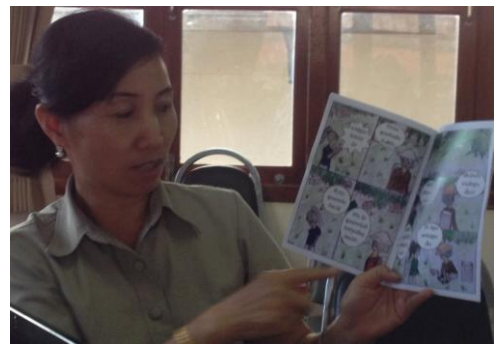
Evaluators are presented with the

Action-oriented research activities involving the group of 198 beneficiaries targeted under the first two components (e.g. field land use mapping, field practicum) also resulted in the publication of a rich variety of print- and audio-visual products. These include: (a) a series of comic and text books on the biodiversity theme, produced by 24 youth groups for use in 40 schools (17 primary and 30 secondary, compared to a planned overall 30 schools), and (b) 30 different short bio-diversity and indigenous knowledge movies, conceived by youth groups under results of the project's biodiversity the guidance of 90 trained youth leaders (available comic and textbook competition