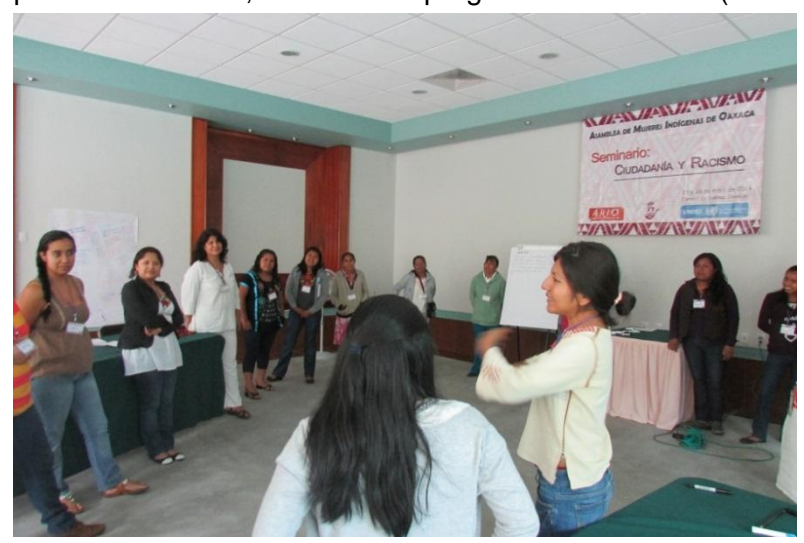
Citizenship and Racism Seminar, AMIO, 2014

The project achieved results that both direct and indirect stakeholders considered very positive. However, some of the programmed activities (in Outcome 2) did not take place. This