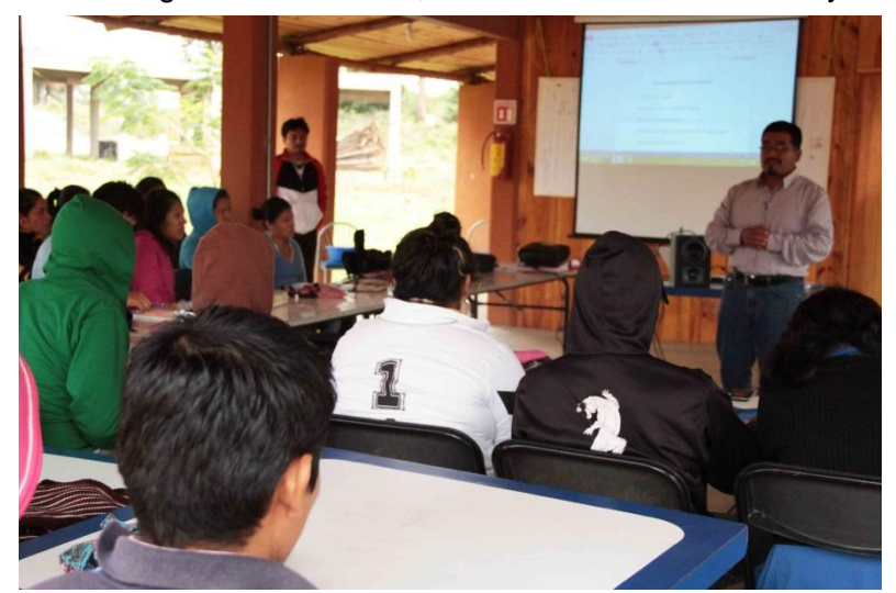
Training workshops in the communities

At the organizational level, SER Mixe A.C. is widely recognized as one of the first