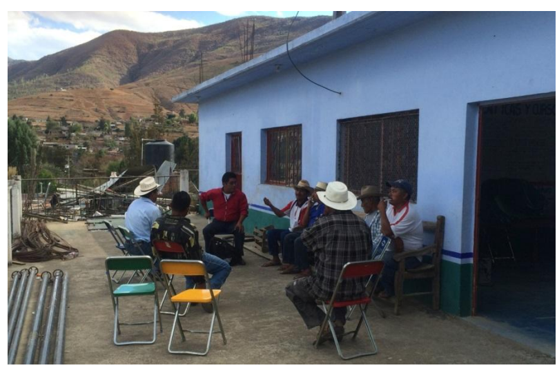
Meeting held as part of the conflict resolution process for affected parties in the community of Magdalena Teitipac

In addition, these secondary laws provide no guarantees or mechanisms to ensure real exercise of the right of indigenous people or communities to information, consultation, and decision-