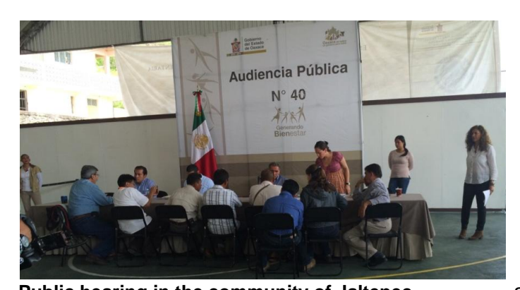
Public hearing in the community of Jaltepec

The project strategy is fully aligned with the institutional mission of SER Mixe, an organization committed since the 1970s to promoting free determination and constitutional, legal, and institutional recognition of indigenous rights for the purpose of building new types of relationships between indigenous peoples, the State, and society. SER Mixe's executive team directly coordinated the project, and three of the organization's five departments were responsible for its implementation, namely Indigenous Rights, Autonomous Indigenous Process, and Gender Equity and Mixe Women.