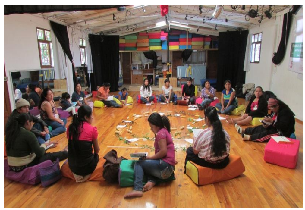
REDDMI Meeting, 2013

Seek alternatives to ensure the financial sustainability of SER Mixe. Viable alternatives must be sought to stabilize the organization's financial situation, reducing its dependence on funding agencies. At the same time, the NGO should review its employment policy, creating a hiring system suited to the profile required to perform the necessary duties – one that offers greater stability in the medium and long term. This system should include the right to social security and, insofar as possible, professional development opportunities for organization staff. (See Conclusions ii and v).