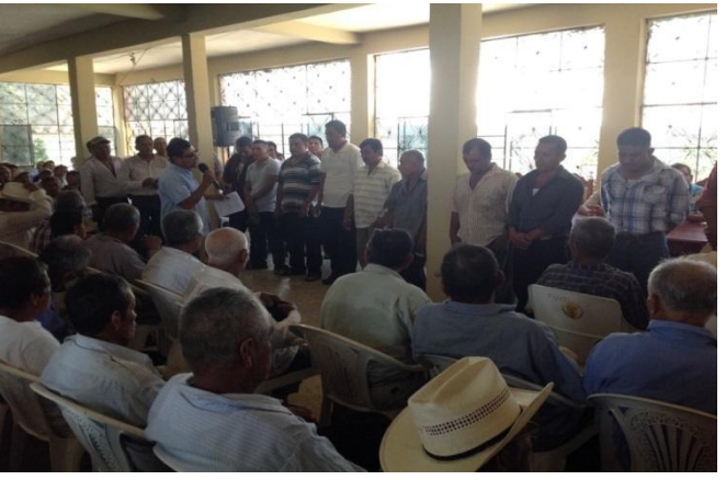
Assembly of Mixe authorities at a meeting in Jualtepec

SER Mixe committed, has professionally competent human resources, which ensured good technical and administrative project management. The organization's Board of Directors was responsible for the coordination and overall monitoring of the project.15 The heads of the Indigenous Indigenous Rights, Autonomy, and Gender Equity and Women departments responsible for executing the activities. Each of these officers was aided by a technical assistant. The Chief of Administration and Finance was in of budget execution and