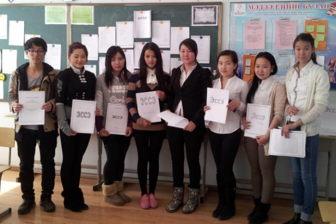
Nalaikh District high school students (above) and junior high students with their teachers (below) show their civics essays.