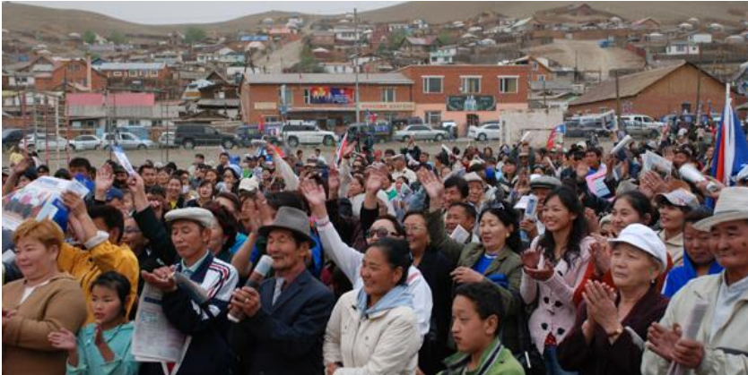
Voters in Chingeltei District