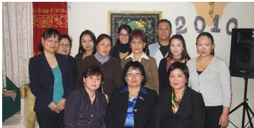
WSP in 2010

The knowledge and skills gained by the staff during the implementation of the project are still in demand. Other CSOs and some international organizations are continuing to request WSP training and presentations on election-related issues. Subsequent training was done using the same materials, for Mercy