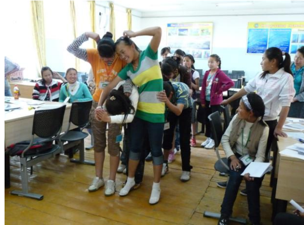
Students participating in pilot WSP Photo

The skills transferred during the training of the social science teachers are also likely to remain. It appeared from the visit to one of the pilot schools that the teachers had been using participatory methods and had a good interaction with their students on the issues related to civics. The students themselves seemed engaged and interested in the topic. Civic education courses are intended to plant the seeds for good citizenship, and these appeared to be rooting in the pilot schools among the current students. The students who had participated in the pilot had already graduated and are becoming first time voters, if not in 2012, then for the presidential election in 2013.