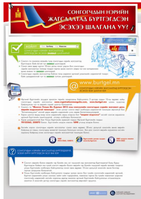
Poster: Voter's List

The efforts to develop a new module for civic education, that contained the information on the structure of government and voter's rights, roles and responsibilities, directly addressed the lack of a civic education program in the schools that was relevant to Mongolian democracy in the 21 st century. The project activities fed into the work being done by the Ministry of Education to modernize its grades 1-10 curriculum. WSP worked directly with the Ministry's Institute of Educational Research which increased its relevance and significance for the Ministry and for the national school system. The teachers and students who participated in the pilot efforts thought the material covered important issues, and the development of a teacher's handbook was seen as innovative and needed by the teachers.