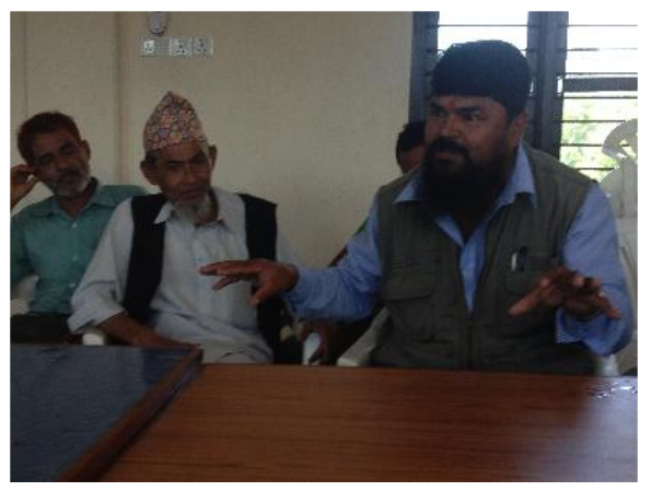
Discussion among MGCC members (Muslim and Bhujel recorded, but community representatives)

Weaknesses in the grantee's approach to data collection limit the evaluators' analysis of impact to a review of anecdotes. Further to the previously noted absence of a baseline that is based on a representative survey (cf. section on relevance), NCARD did also not undertake a systematic survey to study the project's impact.