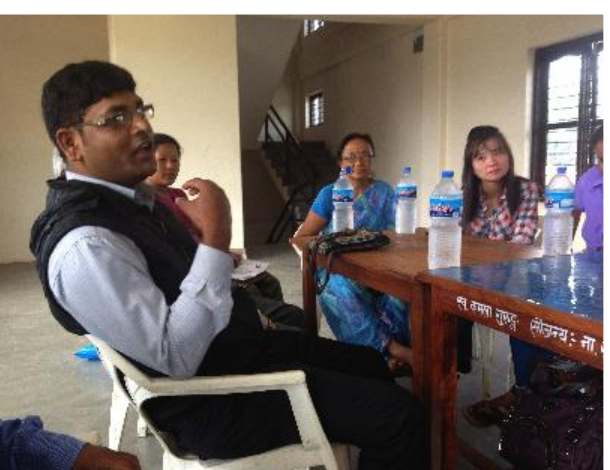
Gurung community representatives).

The grantee organized the above described relevant) discussions of current (i.e. constitutional issues with marginalized group activists in 24 district-, 12 regionaland 1 national-level workshops. In doing so, NCARD achieved remarkable outreach, which significantly exceeded the project's initial target figures. According to the grantee's records, workshop participation amounted to 1,095 (planned: 600) activists at district-level, 766 (planned: 420) activists at regional level and 708 (planned: 45) activists at national level. All workshops were preceded by preparatory meetings serving to clarify scope and identify Discussion among MGCC members (Dalit and participants.