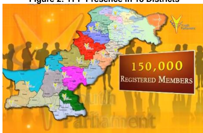
Figure 2: YPP Presence in 18 Districts

The strategy as developed in the Project Document looked to be an effective way to reach large number of young people through different but mutually supportive activities and