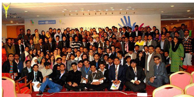
Intergenerational Democracy Symposium in Lahore, 12 December 2012 - YPP Facebook Photo

Project activities culminated in an Intergenerational Democracy Symposium in December 2012 (Figure 8). About 200 youth attended this conference from all over Pakistan. It featured an impressive range of speakers including national and regional deputies and senators, a retired judge, and the Minister of Youth Affairs of Sindh. The intention was to expose youth to veteran democracy activists and to the message that even though “ there are many flaws in Pakistan’s politics, young people must realize that participatory democracy in the only way the country can progress ” 11 . It had two themed sessions, “ Bridging the Gap: Democracy in Pakistan ” and “ Building Inclusive Democracy in Pakistan: Mirage or Reality?? ” along with a cultural evening. Youth were able to ask questions and have them answered by the panel. It received good press coverage and seemed to be a good send off for the end of the