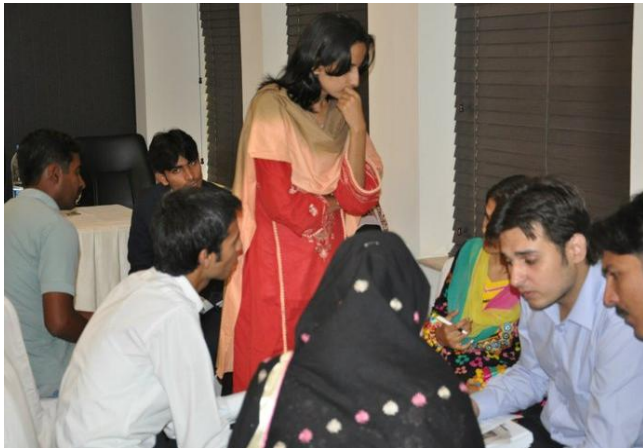
Participants in YAD Orientation Session, June 2011 Lahore

mediums focused on increasing their democratic awareness and participation. It maximized volunteerism and forged links with government institutions that should have resulted in effective and sustainable efforts. According to project reporting and the interviews held with remaining project staff and participants, almost all of the activities were undertaken and outputs delivered. However, there was not enough hard information available on implementation for the evaluators to be able to verify this or to assess the project's effectiveness.