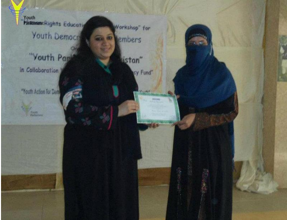
HRE Training March 2012 Hyderabad - YPP Facebook Photo

The impact of this project is impossible to assess without reliable performance data that is attributable to this project. The project used indicators based on number of youth registered to vote, youth turnout, female youth turnout and youth enrolment in political parties and other civil society groups. It reportedly collected this type of data during the start up of the project, however, the baseline numbers were not provided in reporting, nor were the end-of-project numbers, if collected, that could have provided for a comparison between them. The other outcome indicators used were project outputs.