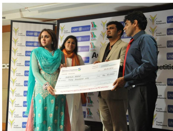
First Prize Winner National Democratic Essay Contest

YPP held a National Democracy Essay Competition in June 2012 in partnership with the Ministry of Human Rights. YPP said it received hundreds of essays. They shortlisted 12 essays and the youth themselves voted for the winners through the internet. The awards were handed out at a public ceremony, and the three top winners received cash prizes (Figure 7). The Project Document also anticipated a video contest which did not seem to have been done even though this was reported as completed in the FNR. This could have been extremely effective in reaching youth given the popularity of the medium.