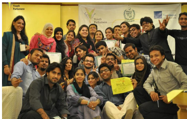
Participants in HRE Training - March 2012, Karachi

next postings were in November-December 2011 calling for applications for “ young, intelligent and hardworking individuals and youth networks/organizations ” to help register students to vote, attend at least one training workshop on how to use COMPASS, and hold five activities within the district. The selected youth attended a peer group discussion workshop held in mid-January 2012 with about 30 participants (Figure 4). According to project reporting, similar discussions were held by the youth district project managers and YPP trainers in 12 districts with 1,800 youth. These workshops included discussions on the results of a situational analysis done reportedly by two project-contracted researchers in 18 districts. A copy of that situational report was not available for the team however, if this was done, it would have been an effective way to disseminate and discuss information on youth attitudes and democratic practices such as voting; especially as YPP stated that it had brought in politicians and others to join the discussions. This would have broadened the experience and increased its importance as it meant that the youth were not just talking to each other but to policy and opinion makers.