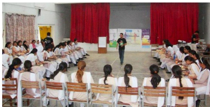
Participants Democratic Citizenship Training, May 2012 Kashmir

YPP also effectively used the star appeal of its Chairman to promote YPP and project activities to reach a wide spectrum of youth and political/civic activists for its DRBs. As a well known singer, the Chairman has a large fan base, and used his artistic connections to develop the multi-media component of the project. This included scripting and recording youth roundtables in Lahore for distribution through CD shops and other outlets. YPP also developed a