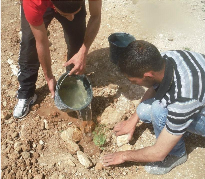
Youth environmental activities