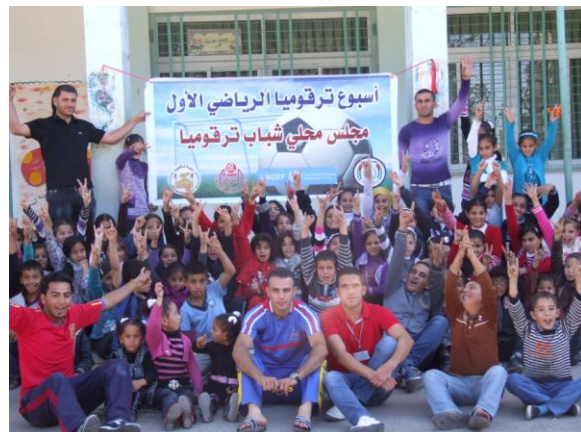
Sports day organized by the Tarkoumea YLC