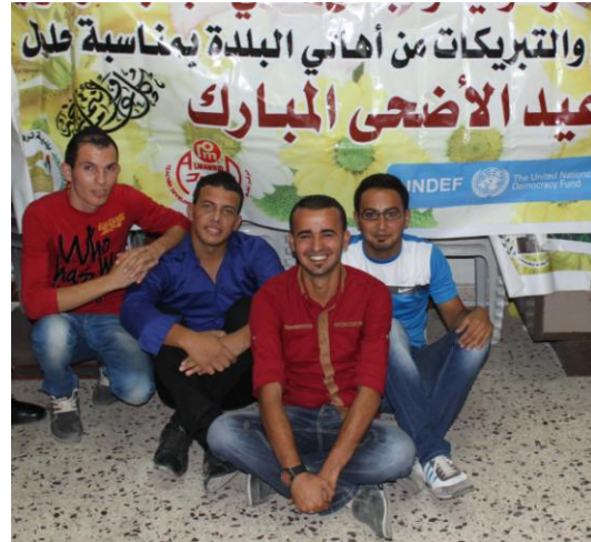
Young participants in Tarkoumea

The young people – not only the elected youth councillors but also the registered voters who were organized into working teams to implement the YLC action plan – said that participation in the project had increased their self-esteem, helped them to work with people and understand the importance of the “volunteer spirit”, as well as equipping them with useful skills acquired not only through the training sessions but also through the activities the YLC had implemented. One of the young women who had been elected to the YLC said that she had once been extremely shy but was now able to participate fully in meetings and address groups. The evaluators heard the story of one young woman youth councillor who had addressed an expert meeting in Ramallah and who had, to quote the trainer who had been there, “shaken us all up; usually these meetings are like a still pond but she caused ripples on the water and everyone appreciated that”. The trainer said the young woman had not been even remotely intimidated. “At our table,” he said, “the speakers were Doctor, Doctor, Doctor, then 17 year-old girl from Dura.”