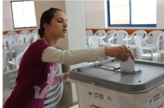
A young participant casts her vote at the Youth Council 2012 elections

In attempting to identify UNDEF value-added , the evaluators spoke to representatives of relevant UN agencies and NGOs. In particular, the evaluators interviewed another Ramallah-based NGO, CHF, which is also engaged in setting up what it calls “shadow councils” for young people in some villages in the West Bank. The evaluators learned that CHF and Almarid had at one time been partners in this work but that they had parted ways over a difference in approach (CHF does not make a direct link between education/training and the setting-up of the councils, and Almarid sees this as essential). CHF’s work is funded by USAID. The evaluators came to the conclusion that UNDEF’s support of the work being done by Almarid was particularly important because it maintained the focus on education and training in democracy, governance and leadership and that, in the long term, is crucial for the future of democracy in Palestine.