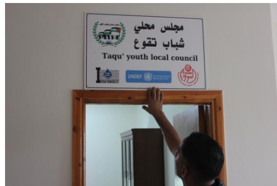
The YLC sign in Tqu'a

The project focused on the creation and work of Youth Local Councils (YLC) in six villages in the West Bank – two in the north, two in the central area and two further south. All the young people in these villages were mobilized to register to vote in the YLC elections and underwent training in citizenship, democracy and electoral processes. Public campaigns were organized by the YLC candidates and supervised voting was held that resulted in the election of between nine and 13 youth councillors in each village. Families, municipal councils, local non-governmental organizations (NGOs) and community members were involved in the campaign meetings or in overseeing the elections. The YLCs then received further training in the skills they would need in order to ‘govern’ effectively: negotiation, leadership, conducting meetings, fundraising, strategic planning and community action. They consulted with their youth constituents, the municipal council and community members, to devise a plan of action to contribute to their communities’ needs, and subsequently undertook a wide range of cultural and social activities, ranging from computer classes for other young people to the painting and renovation of school buildings.