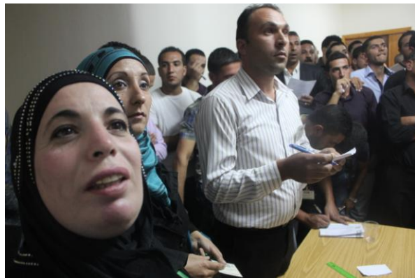
Awaiting the 2012 election results in Tqu’a

The elections followed strict procedures: sealed ballot boxes, checking of voter eligibility, a supervising committee of parents/teachers/NGOs, independent observers and scrutineers and so forth. A quota of 30 per cent female representation was set, reflecting the quota in place in local municipal councils (this was exceeded in five of the six YLCs).