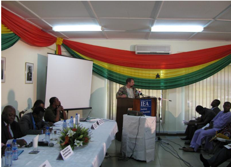
National strategy workshop, Ghana.

The most impressive project event was, however, the 14-19 March 2011 meeting in South Africa, essentially three meetings in one.