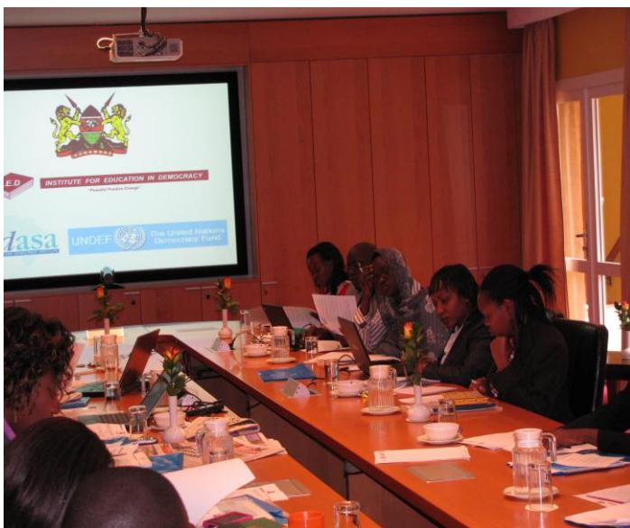
National strategy workshop, Kenya.

The willingness, and ability, of the project to shift funds between countries and adjust activities to meet changing perceptions of need is striking. Few donors would tolerate this.