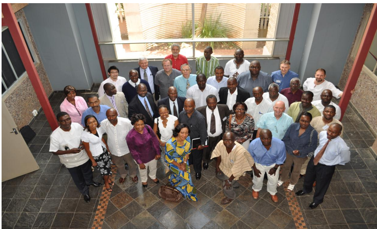
Group photo from the kickoff meeting, Pretoria, 2009.

This was a project that directly benefited the African democracy community, an elite. Would the money have been better spent at the village level on promoting the basics of survival? Nothing could be less clear. The people of Africa will benefit substantially from the strengthening of democratic rule on the continent. In this broadest of senses, the project was a sound investment of resources and relevant to the needs of the people of Africa, not just the small elite who were the direct beneficiaries. By promoting ratification and the coming in force of the Charter, the project also indirectly benefited the African Union.