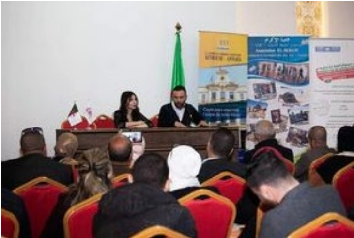
Figure 3: Local Governance workshop- Annaba March 27,2021

Significant delays and complications were caused by public authorities which refused to issue the required authorisation to carry out launch seminars and other project activities. Nonetheless, and despite all the aforementioned, outputs under the first outcome were considerably effective, as local stakeholders (associations and State officials) were greatly mobilised and continued to participate throughout the lifespan of the project, especially in Bordj Bou Arreridj, Annaba and Setif.