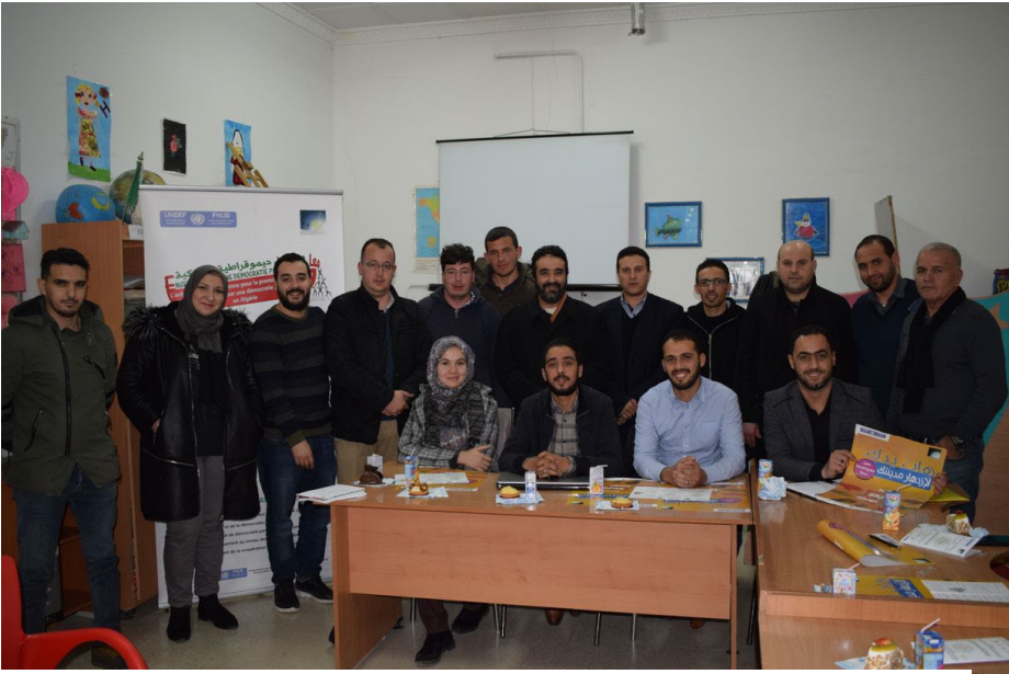
Figure 2: Awareness campaign, El Ikram association, Setif.

Although the project document proposes the integration of "participatory democracy for the sustainable development of the selected municipalities", it is necessary to rectify the terminology to assess the actual contribution of the project. The project's intended aim was to strengthen citizen participation in local development and to strengthen collaboration between civil society and state officials. In general, the project's strategic approach and the compliance with its steps as described in the logical framework contributed to its effectiveness.